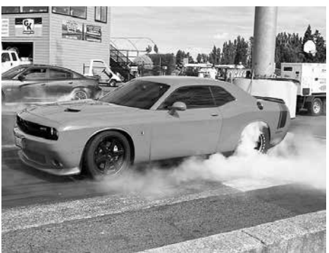
Gratuitous drag car.